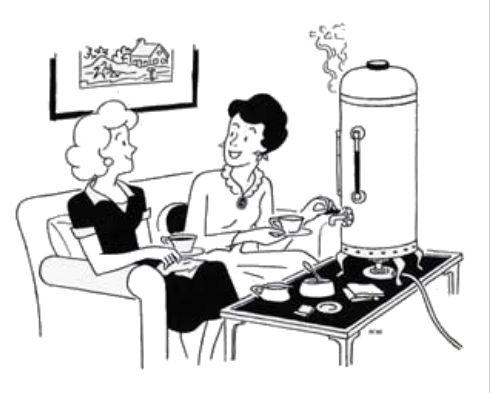
OR vote on last month's captions and view previous winners!

Submit a caption for this cartoon at: www.aagrapevine.org