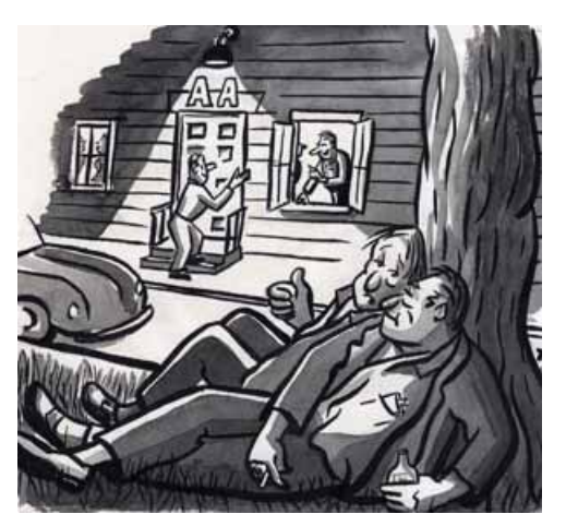
"It's about 12 steps from here. We can make it!"

Sobriety is the leading cause of relapse.